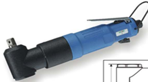
OP-100LH 1/2" Rear exhaust 後排氣